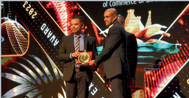
Merit Award at National Business Excellence Awards 2023