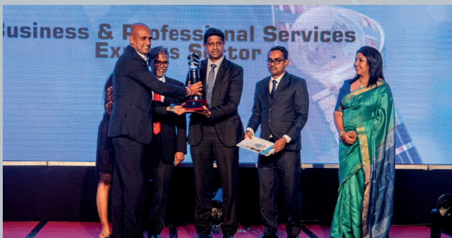
Silver Award at the "30th Annual Export Awards"