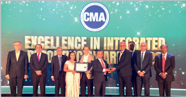
Merit Award at CMA Integrated Reporting Awards